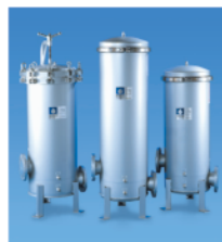
High Flow Multi Cartridge Housings