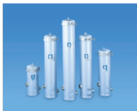
Multi Cartridge Housings