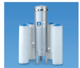
Jumbo Cartridge Housings