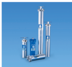
Single Cartridge Housings

Shelco® manufactures a full line of filter housings. From our rugged single element housings to our heavy-duty multi-rounds and bag housings, we have the right filter for your requirement. Shelco® is the perfect choice for your problem solutions.